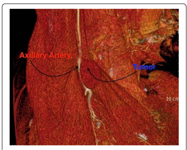
Fig. 3 CT angiogram showing the tumor compressing the axillary artery

The tumor was exposed through extensile deltopectoral approach after developing intermuscular planes and reflecting pectoralis muscles. The tumor was located anteromedial to the third part of the axillary artery pushing the medial root of the median nerve anterolaterally and the origin of the ulnar nerve medially (Fig. 4). We were able to dissect out the axillary artery and the median nerve easily away from the tumor. However, the