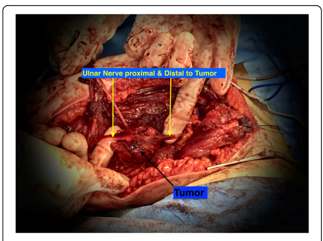
Fig. 5 The ulnar nerve was intimately adherent to the tumor

Her final histopathology revealed monophasic synovial sarcoma with microscopically free margins. The patient did not receive postoperative radiation. Upon follow-up, 9 months after surgery, no clinical or radiological recurrence was observed.