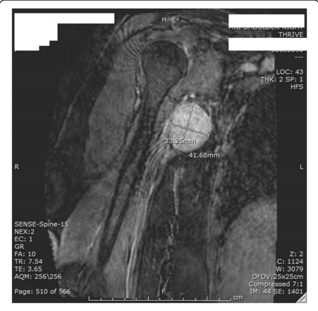
Fig. 1 MRI (coronal view of the heterogeneous axillary mass)

Based on the radiological and the histopathological findings, the plan was to proceed with mass excision after exploration of the axillary artery and the surrounding brachial