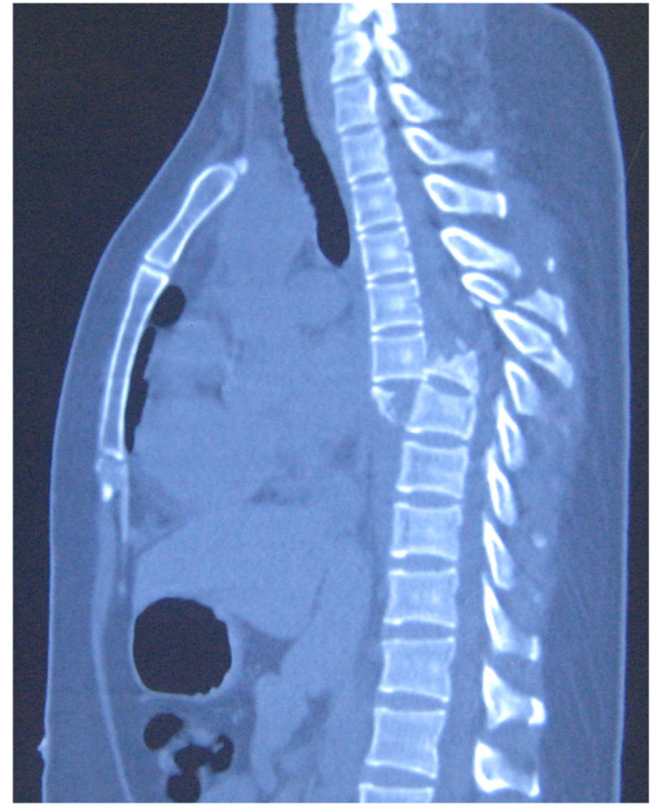
Fig. 2 Preoperative sagittal view of computed tomographic scans of the thoracic spine revealed the burst fractures of T7 vertebrae and complete dislocation of T6 vertebrae