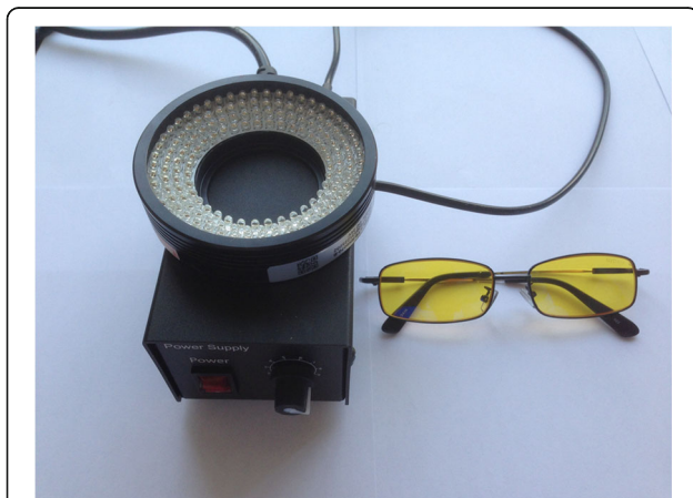
Fig. 1 LTS-RN9070 blue light source system and goggles with blue light filter

All rabbits in the FS group and isosulfan blue group were kept in the same cleaning cages and were fed with the same rabbit feed (corn 80 %, hay 10 %, bran 5 %, bone meal 3 %, salt 2 %, no autofluorescence ingredient was included). No significant differences were observed between the FS group and isosulfan blue group regarding weight, the distances between the detected sentinel lymph nodes and second pair of mammary areolas, or the distances between the second lymph nodes and second pair of mammary areolas (Table 1).