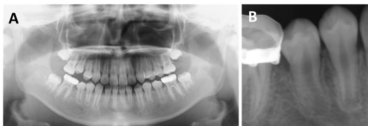
Fig. 3 Radiographs obtained 1 year and 9 months after marsupialization. a Panoramic radiograph showing disappearance of the radiolucent lesion and normal eruption of the second premolar. b Periapical radiograph showing normal root formation in the second premolar

No signs of recurrence were observed during 7 years of follow-up in our patient. However, further follow-up