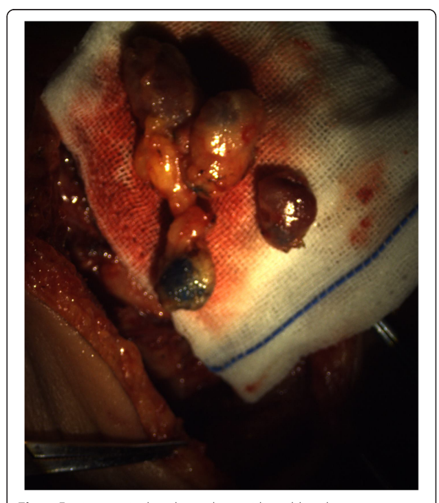
Fig. 4 Ex vivo sentinel nodes with or without blue dye