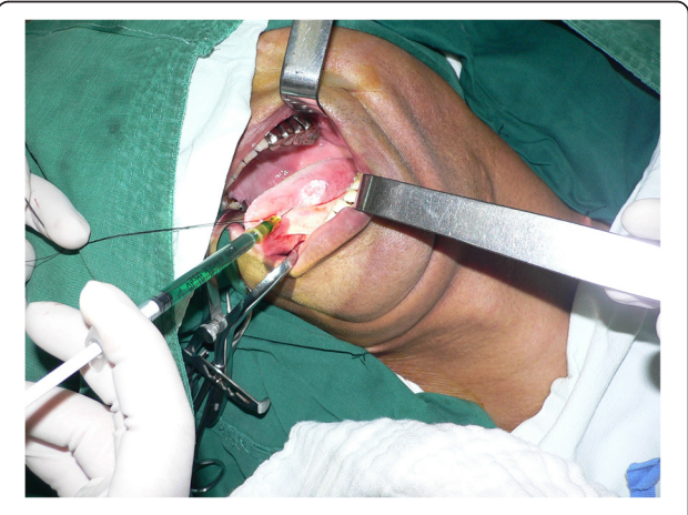
Fig. 1 One milliliter of indocyanine green at a concentration of 5 mg/ml was injected around the tumor in a four-quadrant pattern

The ICG (Dandong, China) was dissolved at a concentration of 5 mg/ml, and the methylene blue (Beijing, China) was prepared at a concentration of 10 mg/ml. One milliliter of ICG was injected around the tumor in a four-quadrant pattern (Fig. 1); 1.5 ml of methylene blue was then injected in the same manner. Immediately after injection of the tracers, a standard incision was made and the platysma flap was elevated. After exposure of the subplatysmal plane in the neck and retraction of the sternocleidomastoid muscle posteriorly, the surgical field