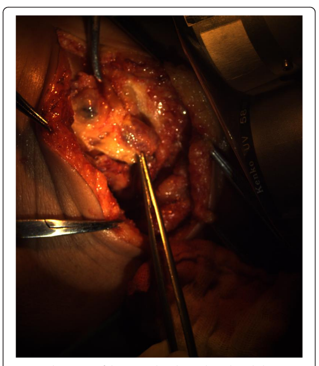
Fig. 3 Color image of the sentinel nodes under "white" light source shows visible blue dye

Clinical data of the patients are detailed in Table 1. A total of 26 consecutive patients with squamous cell carcinoma of the oral cavity (n = 19) or oropharynx (n = 7) and a clinical stage of T1-3N0M0 were enrolled in this study from July 2014 to December 2014. Median patient age was 60.5 years (range 43–77 years). Fifteen patients had cT1 primary, eleven patients had cT2.