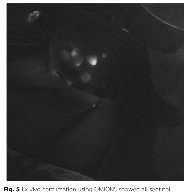
Fig. 5 Ex vivo confirmation using OMIONS showed all sentine nodes had fluorescent hot spots

Location of primary tumor included oral tongue (n =14), buccal mucosa (n = 3), palatoglossal arch (n = 3), base of the tongue (n = 3), hard palate (n = 2), and soft palate (n = 1). All patients underwent a radical resection of the primary tumor with negative surgical margins. Of the 26 patients, eleven needed a surgical reconstruction (radial forearm flap, n = 7; infrahyoid myocutaneous flap, n = 2; local mucosal flap, n = 1; skin graft, n = 1), whereas primary closure was possible for the remaining patients. Ipsilateral SND was performed in 20 patients, modified radical neck dissection (MRND) was performed in 5 patients, and bilateral SND was performed in 1 patient; selection of an appropriate ND type was based on clinical indications. The sentinel node excision was performed prior to the reconstructive surgery; SNB did not have any impact on reconstruction. There were no complications associated with the technique. SNB added an average of about 15 min to the total operation time compared with a standard neck dissection procedure.