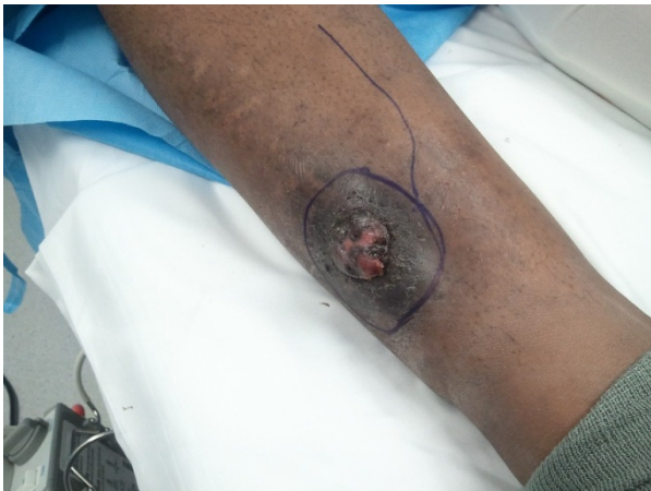
Figure 1 Preoperative image of the pink exophytic outgrowth - 2.0 x 3.0 cm.