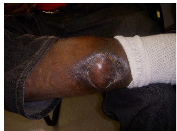
Figure 4 Postoperative image of the excised area with a soleus muscle flap reconstruction.

Treatment of choice for EPC is total surgical excision with broad tumor margins and regional lymph node dissection if involved. There is still insufficient literature