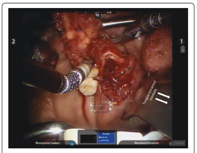
Figure 3 Dissection of the left sublingual gland (SLG) with identification of the terminal branches of the lingual nerve and delineation of the Wharton's duct.

Transoral resection of the ranula with the involved sublingual gland provides the best outcomes for ranula surgery with the least recurrence rates [1-3,5]. In a study of 606 procedures in 571 patients, Zhao et al reported the most common complications associated with transoral ranula surgery included recurrence of the lesion (34.6%), sensory deficits of the tongue associated with lingual