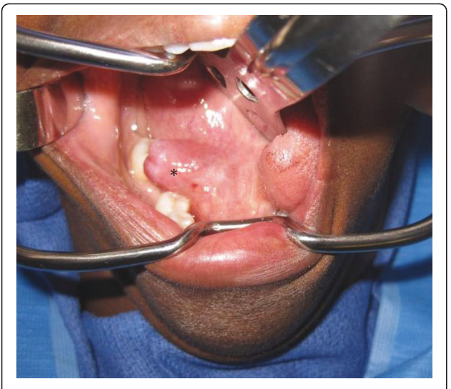
Figure 1 Clinical picture showing a right floor of mouth ranula (* indicates the lesion).

The transoral resection of the ranula was performed using the da Vinci Si Surgical System. The oral cavity and surgical site were exposed using a self-retaining retractor (Jennings's mouth gag) and a Sweetheart tongue retractor. The robotic arms of the da Vinci Si-System were placed into position in the patient's mouth, while the surgeon controlled the instruments from the control console within the room. The robotic arm