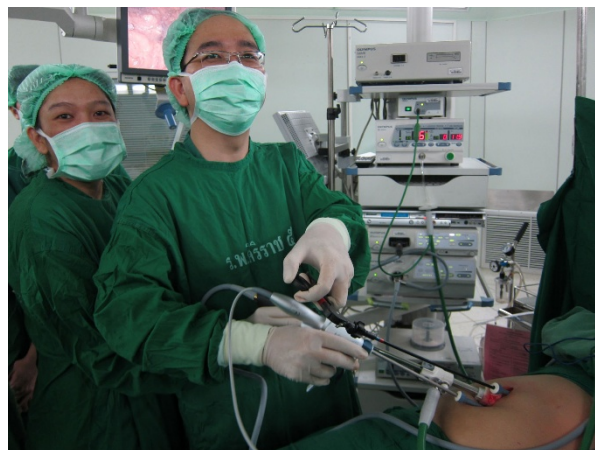
Figure 2 Picture demonstrating the position of the surgeon.

Santa Margarita, CA, USA) was applied for wound protection. The specimen was extracted through the mid-line incision. Colonic resection and making anastomosis were performed extra-peritoneal cavity by double staples or hand-sew technique.