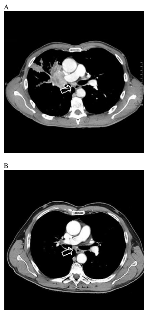
Figure 2 Chest computed tomography scan (A) before treatment of docetaxel (B) 10 months after treatment. The arrows show the mediastinal lymph node metastasis that gradually reduced in size.

Preoperative, platinum-based combination chemotherapy is safe and active in NSCLC, although a randomized trial reported a modest, not statistically significant excess of post-surgical morbidity and mortality[3]. As single-agent therapy is associated to a lower response rate, but also to lower toxicity[4], single-agent docetaxel