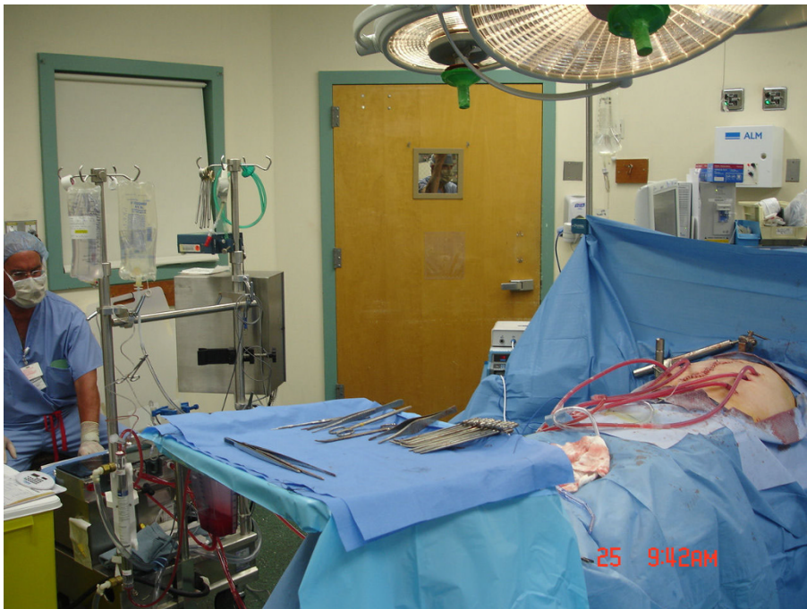
Figure 3 Using a cardiopulmonary bypass machine, The HIPEC circuit is completed.

Figure 2 Using a closed technique: Two inflow and four outflow catheters were used for HIPEC administration. Only the skin of the surgical wound is temporarily closed.