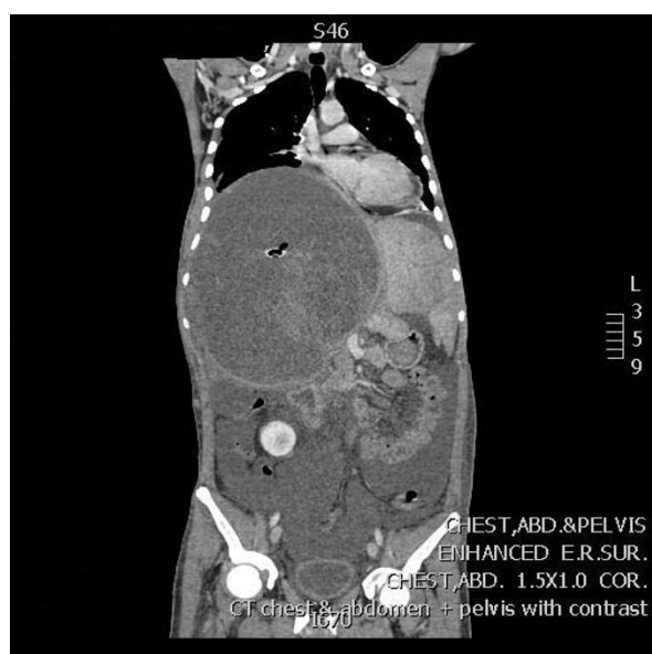
Figure 1 A computed tomography (CT) scan of the abdomen with a large lesion occupying the right hepatic lobe.

native country. Three weeks post-discharge he re-presented to our institution with a fungating abdominal wall mass at the site of previous percutaneous drain insertion. CT scan revealed a new lesion in segment II and an intra-abdominal lesion extending through the drain site 5 cm outside the skin (Figure 3). The skin lesion was resected and histopathological examination revealed metastatic UES. He elected to go back to his country of origin where he received adjuvant