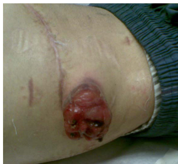
Figure 3 Intra-abdominal lesion extending through the drain site 5 cm outside the skin.

chemotherapy which was ifosfamide plus etoposide alternating with actinomycin-D, vincristine every 3 weeks for 6 months. He is currently 5 months post-resection and a recent CT scan showed no evidence of disease recurrence.