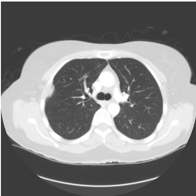
Figure 1 Chest CT obtained February 2006 showing pleural accumulation of mucinous adenocarcinoma.

In March 2006 chest CT showed obvious progression of disease in the right pleural space (Figure 1). She had a right thoracotomy with complete stripping of the parietal pleura, partial removal of the visceral pleura and hyperthermic (41.5°C) intrapleural chemotherapy with doxorubicin and mitomycin C plus intravenous 5-fluorouracil and leucovorin for 90 minutes. Postoperatively, the patient had an air leak requiring prolonged chest tube