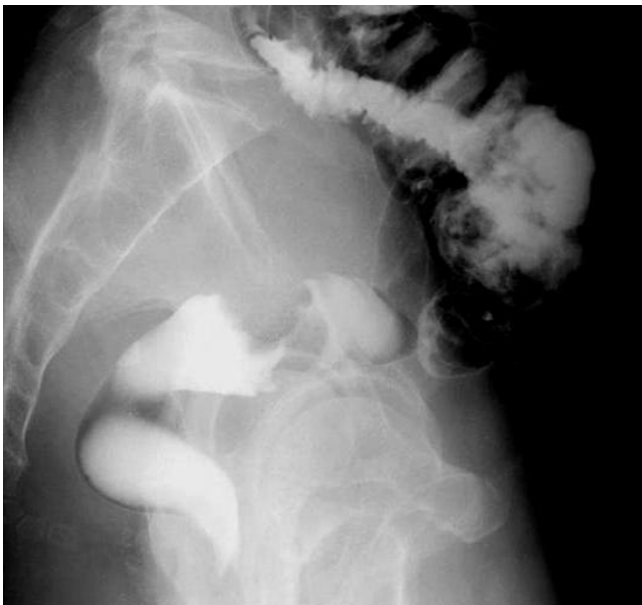
Figure 1 Barium enema revealed an ulcerative tumor in the rectum.

An ulcerated hard tumor was present in the rectum (Figure 2). Histopathological examination revealed that the tumor consisted of large abnormal cells without gland formation and mucin production (Figure 3a). Immunohistochemical studies were positive for cytokeratin and