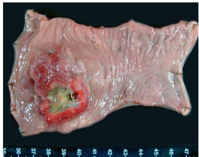
Figure 2 Resected specimen. An ulcerated hard tumor was present in the rectum.