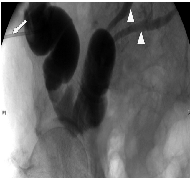
Figure 4 Resolved anastomotic insufficiency in radiologic control; contrast agent applied through catheter in ileal conduit (white arrow). Small white arrow heads point at ureters.

fistula resolved as demonstrated by radiological control (figure 4). For the remaining wound defect of the abdomen conventional wound care and secondary closure after 15 days were employed. Final endoscopic and radiologic controls of the conduit showed gradual mucosal coverage in the area of the anastomosis. The patient recovered well and was admitted to a rehabilitation unit. After a follow-up period of 13 months no further anastomotic insufficiency was noted.