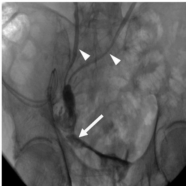
Figure 1 Anastomotic insufficiency (white arrow) in radiologic control. Small white arrows point at ureters.

A 83-year old patient in good medical condition underwent radical cystectomy and urinary diversion by Bricker ileal conduit for pT3a, G3, pN0, R0 urothelial bladder cancer. On the 3 rd postoperative day, wound drains showed fecal secretion and relaparotomy was undertaken. Intraoperatively, massive adhesions and ileoileal anastomotic insufficiency were found. Extensive lavage of the abdomen was performed, the former ileoileal anastomosis resected and reconstructed. Severe wound healing disorder occurred resulting in an open abdomen. A further relaparotomy and extensive lavage were performed on the 9 th postoperative day; despite massive adhesions full overview of the surgical site could be obtained. There was no macroscopic sign of anastomotic leakage at this point. As primary wound closure could not be achieved, open wound care was initiated consisting of wet saline dressings changed every two days following minor abdominal lavage. On the 16 th postoperative day, leakage of urine was suspected due to increased secretion of the wound and confirmed by radiographic imaging. Relaparotomy was mandated, ureteroileal anastomosis reconstructed and two nephrostomies placed. Persistent exudation led to the assumption of continued anastomotic insufficiency, which was confirmed by flexible endoscopy and radiologic control (figure 1). The leakage probably due to