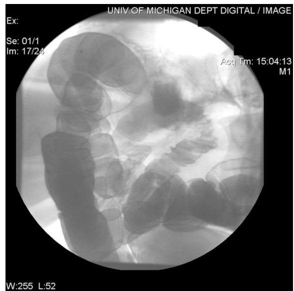
Figure 4 Follow-up barium enema revealing no evidence of distal obstruction and anatomy suitable for segmental intestinal resection of the enterocutaneous fistula. Contrast refluxed from the anus through the previously obstructed area, and out the fistula.