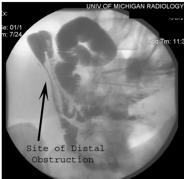
Figure 1 Fistula injection with small bowel follow-through demonstrating distal obstruction of small bowel.