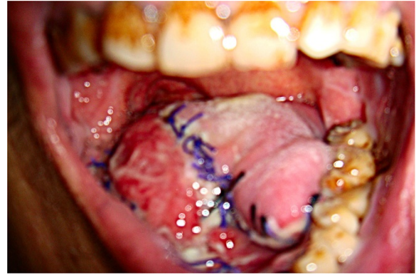
Figure 3 Submandibular gland flap for reconstruction of tongue cancer. One week postoperatively, surface mucosalization of the submandibular gland is bright red.

Postoperative follow-up began at the completion of treatment and ended 31 May 2013. No patient was lost to