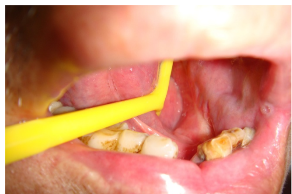
Figure 4 Submandibular gland flap for reconstruction of gingival cancer. Three months postoperatively, submandibular gland is essentially the same color as the oral mucosa.

To date there has been no consensus about preservation of the submandibular gland during neck dissection in oral cavity and oropharyngeal cancers. Traditional surgical treatment includes excision of the submandibular gland and the surrounding lymphatic tissue in addition to removal of the primary lesion. Submandibular glands are frequently excised as part of neck dissection. With the development of functional surgery, an increasing number of investigations have demonstrated that cancer metastasis to the submandibular gland is quite rare and that it is feasible and oncologically safe to preserve the submandibular gland with no involvement of cancer metastases during neck dissection followed by close postoperative follow-up. Whether to preserve the submandibular gland depends on the following conditions: (1)