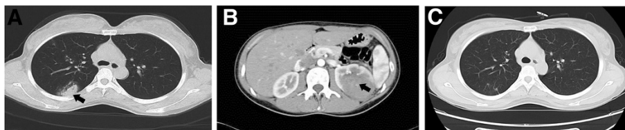
Figure 1 CT (computed tomography) imaging of the lung and kidney of the patient. Breast carcinoma with choriocarcinomatous features (BCCF) metastatic to the lung (A) and left kidney (B). The metastatic lesions are indicated with black arrows. (C) The lesions in the lungs disappeared after a further 9 cycles of capecitabine.

Grossly, the left breast of the patient was normal and BCCF did not protrude through the skin surface. The BCCF was 3.2 \times 3.2 \times 1.8 cm in size, and was a solid, well-circumscribed, and dark red mass, with extensive necrosis and hemorrhage in the lesion. The BCCF metastatic to the kidney was 5 \times 3.5 \times 2 cm in size, and was a solid, well-circumscribed, and chromatic mass, with extensive necrosis and hemorrhage in the lesion.