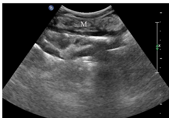
Figure 2 Data for a 37-year-old man. Ultrasonography showed a cake-shaped thickening of the omentum (M) with homogeneous hyperechoes; this thickening was then pathologically diagnosed as tuberculosis of the peritoneum.

The complications were evaluated within 12 hours after the biopsy. Fifteen patients experienced pain at the operation site, which eased off later without treatment.