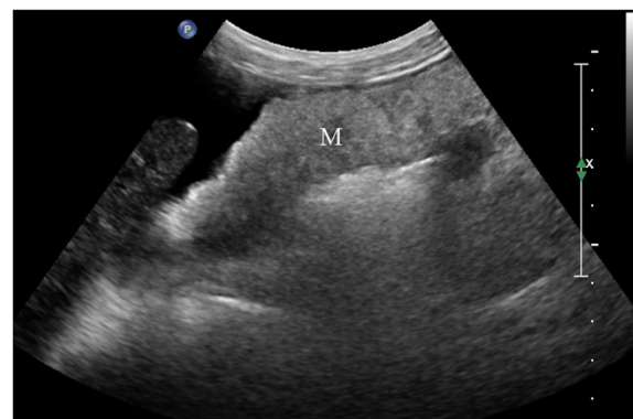
Figure 1 Data for a 56-year-old woman. Ultrasonography showed a cake-shaped thickening of the omentum and a nodosity-shaped thickening of the peritoneum (M); these thickenings were pathologically diagnosed as metastatic mucinous adenocarcinoma.

The accurate identification of the peritoneal and omental lesions by ultrasonography is essential for the success of the biopsy. Here, all of the patients had a locally or diffusely thickening peritoneum (thickness range, 0.8 to 3.7 cm; mean thickness, 1.7 \pm 0.8 cm). Among all the patients, 114 had a cake-shaped thickening of the peritoneum or omentum (Figure 1), and 39 had a nodous peritoneum or omentum. Overall, 74 patients with a thickened omentum had a heterogeneous hypoechoic pattern, 59 patients had a hyperechoic pattern, and 20 patients had both patterns. The thickened peritoneum or omentum tended to be stiff, and it made the lesions hard to deform with the transducer compression. Ascites were present in 123 patients; of these, 30 had a large volume, 42 had a moderate volume, and 51 had a small volume.