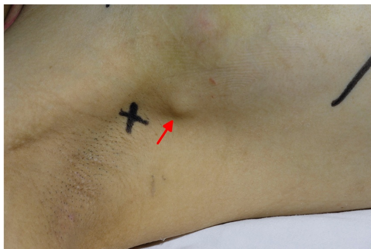
Figure 2 The arrow points to an axillary mass.

Pathological examination of the surgical material revealed 1.9-cm invasive lesions accompanied by an 8.5-cm intra-ductal lesion. These lesions were continuous with each other (Figure 4). The characteristics of her invasive lesion were as follows: estrogen receptor (ER)-positive, progesterone receptor-positive, HER2-negative, 23% of Ki67, nuclear grade 3, and no sign of lymph-vascular invasion.