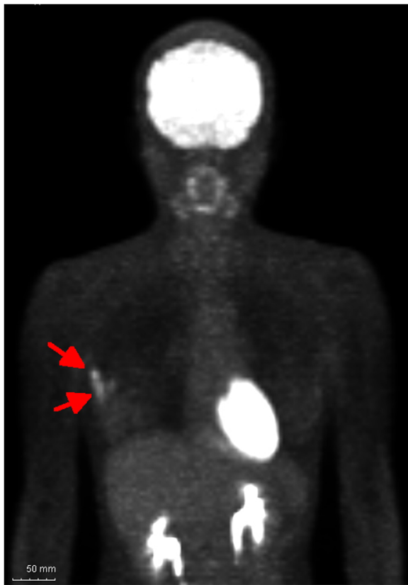
Figure 1 The arrow in this positron emission tomographic image indicates enhanced areas including the axillary mass and the lesion in the upper outer quadrant of the breast.

Her screening mammography showed no abnormal findings. However, spot mammography confirmed a round well-circumscribed high-density mass in the axillary area. Ultrasonography showed a 1.4-cm oval-shaped, well-circumscribed echoic mass corresponding to the axillary lesion on physical examination and mammography. There were no abnormal findings, however, in the vicinity of the tumor. No swollen lymph nodes were detected.