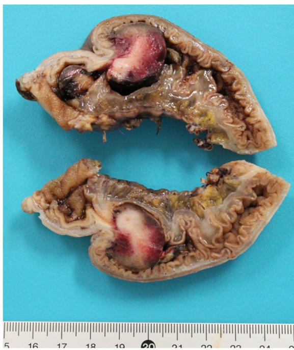
Figure 2 Macroscopic view of the specimen showing the intraluminal metastasis of osteosarcoma.