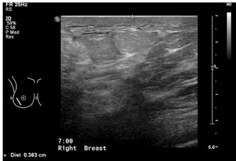
Figure 1 Right breast ultrasound showing skin thickening and underlying marked inflammatory changes with increased echogenicity.

There was no lymph node involvement and the margins were clear. The estrogen and progesterone receptors status were both negative. Her2 neu score was positive. Her post-operative recovery was uneventful and the patient did not require any further treatment.