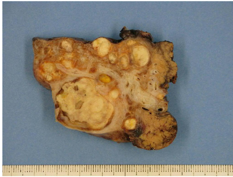
Figure 3 Gross examination of cirrhotic liver parenchyma with multiple white nodules.

a patient with cirrhosis and HCC has been reported in the literature [6].