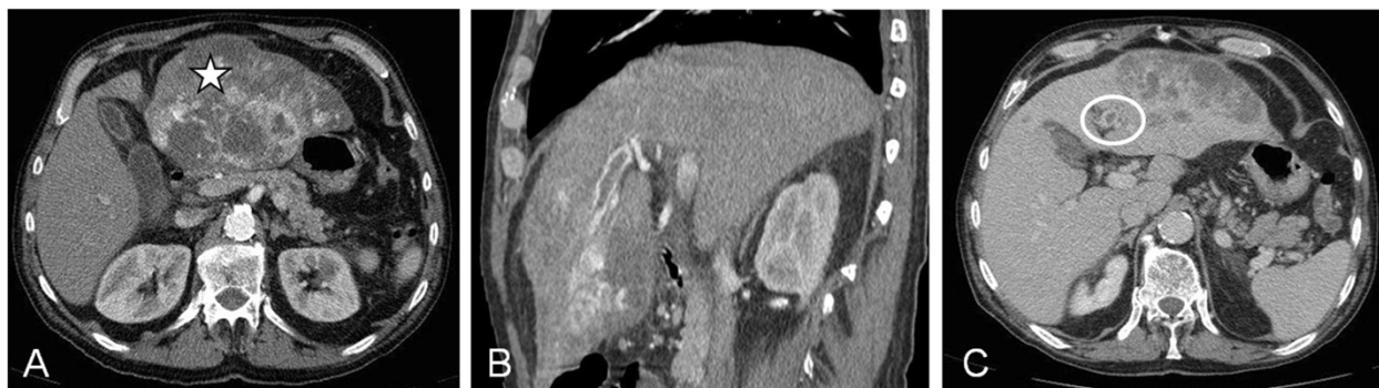
Figure 1 Computerized tomography (CT) scan features of the liver tumor. Liver tumor with (A) arterial enhancement (star), (B) portal washout and (C) portal vein thrombosis (PVT) (circle). CT, computerized tomography; PVT, portal vein thrombosis.

in the left liver measuring 15.7 cm and with left intrahepatic portal branch thrombosis (Figure 1). Typical radiological features, including hypervascular and portal phase washout, together with an increase in alpha-fetoprotein (AFP) serum levels at 986 ng/mL (normal <20 ng/mL), confirmed diagnosis of HCC without performing liver biopsy [2]. The size of the lesion associated with a portal thrombus prohibited curative surgical treatment [3]. Considering the patient's general state of health and the Child-Pugh class (A6), palliative treatment with sorafenib (800 mg/day) was initiated in January 2011.