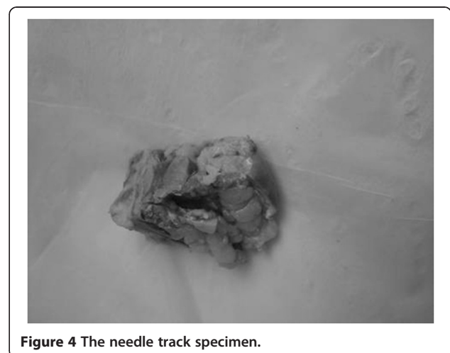
Figure 4 The needle track specimen.

radiography, computed tomography, and magnetic resonance imaging. Biopsy methods include pre-operative open biopsy, core needle biopsy and the intra-operative biopsy. However, both the open and the intra-operative biopsy carry the risks of non-healing of incision and tumor implantation of needle track. Enneking [5] reported that the local contamination rate by tumor cells of intra-operative incision was 39%. With the development of diagnostic technology, the core needle biopsy is being used extensively because of its simple manipulation, minimal invasiveness into the adjacent tissue and reliable results [6].