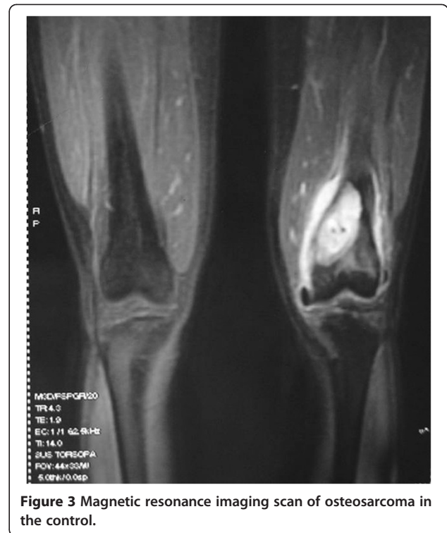
Figure 3 Magnetic resonance imaging scan of osteosarcoma in the control.

EFS, event-free survival; OS, overall survival.