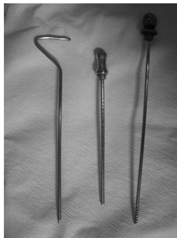
Figure 1 The puncture needle: the inner needle, outer cylindrical cuff and spring-loaded cutting needle.

For the control group, no gelatin sponge was used to fill the biopsy track, the biopsy syringe was withdrawn immediately after the biopsy was taken, and the biopsy site was compressed with a dressing.