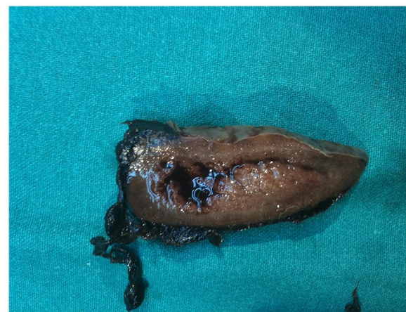
Figure 2 Section of spleen in which can be seen laceration of the capsule due to rupture in two times.

The postoperative course was complicated by the onset, on the fourth day, of partial thrombosis of the great saphenous vein; the diagnosis was confirmed by sonography and a therapy of 40 mg low molecular weight heparin (LMWH) (Clexane ® , Aventis Pharma, Bad Soden, Germany; 0.4 mL prefilled syringes) subcutaneously administered twice daily was undertaken. The abdominal drainage was removed 5 days after the operation, and the patient was discharged on the following day.