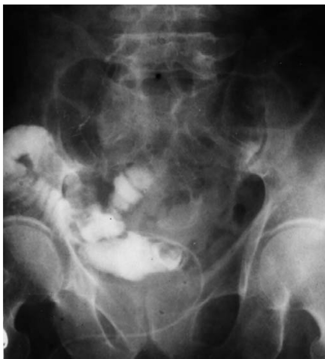
Figure 3 Fistulogram showing the communication with the small bowel.

ing techniques has led to the evolution of a "three dimensional treatment planning and dose delivery" system, which may eventually assist radiation oncologist in achieving this goal [5].