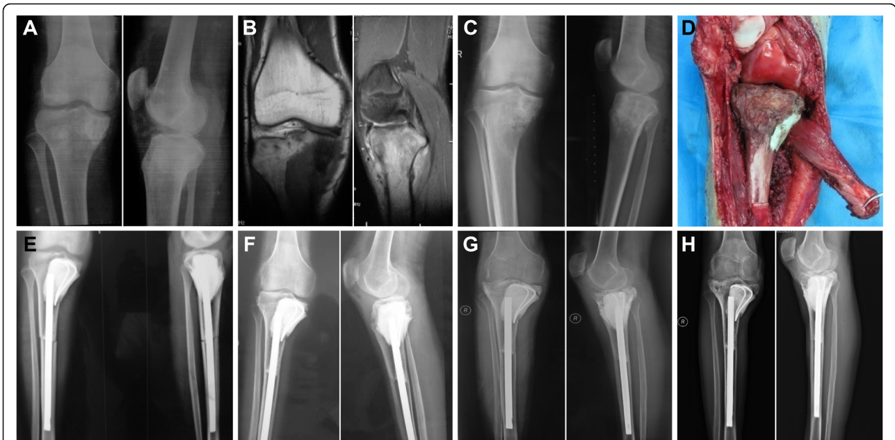
Fig. 2 A Prechemotherapy X-ray examination showing osteolytic bone destruction in the right proximal tibia of an 18-year-old male patient who underwent joint preservation alcohol-inactivated autograft replantation for osteosarcoma. B Prechemotherapy coronal and sagittal MRI scans show a mix of high and low signals inside the medullary cavity of the tibia and surrounding soft tissue. C Two months after chemotherapy, the X-ray examination revealed that osteolytic bone destruction had markedly decreased. D The photo taken during surgery showed that the alcohol-inactivated autograft segment was filled with bone cement in the bone defect of the medial tibial plateau, replanted for reconstruction and firmly fixed by intramedullary nail fixation. E Radiographs taken 1 week after surgery showed solid internal fixation and joint preservation of the knee. F At 1 year after surgery, the X-ray examination revealed bone healing, but articular space narrowing was observed. G X-ray taken 3 years after limb salvage surgery. H At the 7-year follow-up, the X-ray examination of the right knee showed the condition of the alcohol-inactivated autograft segment. The subchondral bone was partially resorbed and fractured, narrowing of the space was observed, and arthrosis was indicated

bearing activities within 3 to 6 months after the operation. All patients received nutritional support and were told to avoid strenuous exercise.