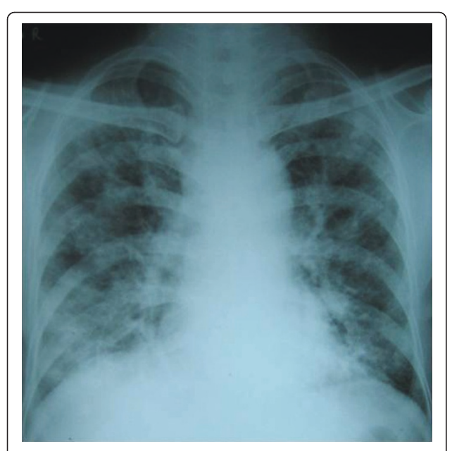
Figure 1 CXR: Chest Radiograph showing septal lines.

PLC was by Gabriel Andral in 1829 [2]. The diffusely infiltrating pattern of metastasis as seen in PLC occurs in 6-8% of lung metastases [3]. 80% of them are from adenocarcinomas. The common sites of primary from which PLC occurs are cancers of breast, bronchus, and stomach [4,5]. The other described sites with PLC are cancers from colon, pancreas, kidney, cervix, thyroid, larynx and hypopharynx [6-8].