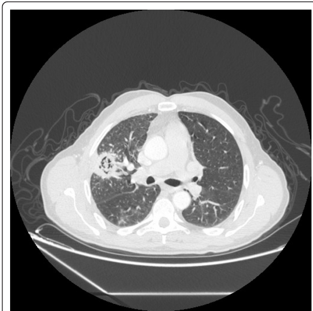
Figure 2 Cavitated lesion on horseback on the segments of the right upper lobe, with a central heterogeneous rounded density.

and when a cancer is combined, a carcinologic surgery and médiastinal lymph node dissection is done.