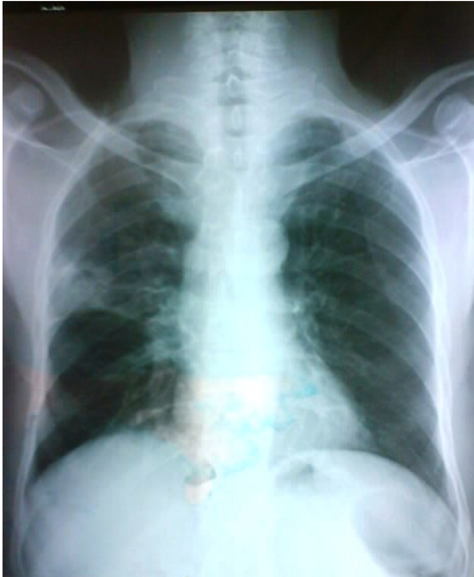
Figure 1 Cavitary lesion of upper right lobe with "air crescent sign".

may be associated with its formation, usually in the upper lung fields. The diagnosis of PA is usually established radiologically by demonstrating the characteristic appearance of the fungus ball and confirmed by Aspergilloserology and/or by CT guided needle aspiration biopsy, as in the case here present.