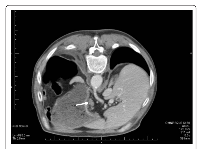
Figure 3 The stomach was markedly dilated. The stomach was markedly dilated, and hypertrophy of the antral stomach wall and 15-mm lymph node swelling around it were noted.

In spontaneous rupture of the esophagus, a sharp rise in intraesophageal pressure due to vomiting causes fullthickness (mucosa and muscle layer) rupture. Since the disease was initially reported by Boerhaave [1] of