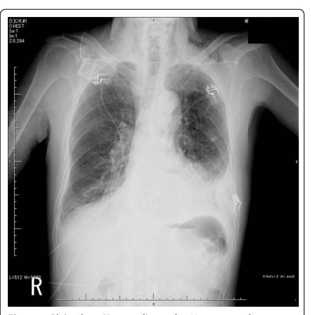
Figure 1 Plain chest X-ray radiography. No apparent free air was present, but marked right pleural effusion was observed.

The first surgery was performed employing sequential left thoracoabdominal incision. The chest wall was adhered due to inflammation, and large amounts of residual food and sloughing were present in the thoracic cavity and mediastinum (Figure 4). Moreover, necrotic changes were noted in the superior through inferior mediastinum. An about 2-cm rupture site was identified on the left side of the lower thoracic esophagus and closed by suture and filling with pediculate omentum. Necrotized substances were removed as much as possible, followed by massive irrigation. The presence of a tumorous lesion mainly in the body of the stomach and lymph node enlargement were also diagnosed before surgery, for which gastric and intestinal fistulae were inserted to prepare for the second-stage surgery (Figure 5). After surgery, the patient was admitted to an ICU, in