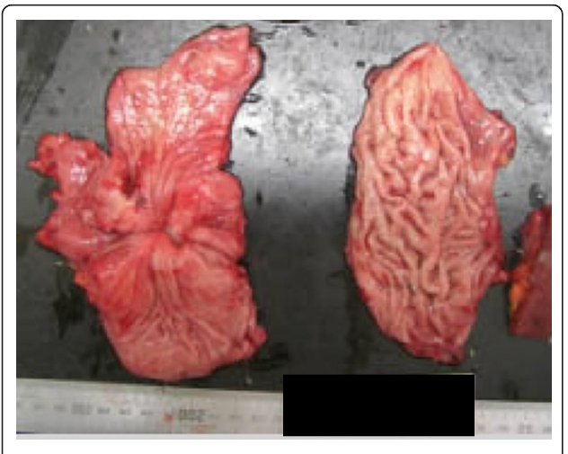
Figure 5 Total gastrectomy + splenectomy + D2 lymphadenectomy could be performed at 40 POD after the first surgery. The final pathological diagnosis was pStagelV (TNM classification: T3N1M1) with por 2 and No. 10 lymph node metastasis (Japanese Classification of Gastric Carcinoma).

There is a high incidence in men, accounting for 92% of all cases. The onset age peaks in the 40s, and