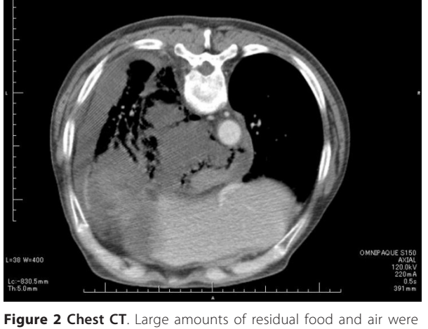
Figure 2 Chest CT. Large amounts of residual food and air were observed in the mediastinum, and pleural effusion was also present.

which concomitant ARDS and sepsis developed. Moreover, MRSA-induced pneumonia and enteritis also developed but remitted. Total gastrectomy + splenectomy + D2 lymphadenectomy could be performed at 40 POD after the first surgery. The final pathological diagnosis was pStageIV (TNM classification: T3N1M1) with por 2 and No. 10 lymph node metastasis (Japanese Classification of Gastric Carcinoma). The postoperative course was favorable, and the patient was alive as of 2 years after surgery.