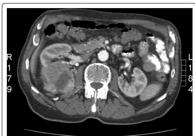
Figure 3 Large clear cell renal cell carcinoma prior to nephron-sparing surgery in a patient with chronic renal failure.

standard of care for localized resectable RCC of any size [1,22,23], although this is not yet reflected in routine clinical practice. A recently published population-based case-control study conducted by Miller et al. [6] in metropolitan Detroit and Chicago showed that until 2007 almost 80% of patients with localized RCC were treated by radical and only 20% by partial nephrectomy. This is alarming, since several trials have clearly demonstrated that total removal of the kidney was associated with a higher risk of postoperative renal failure [2], cardiovascular disease [3], diabetes [4] and even early death [3,5].