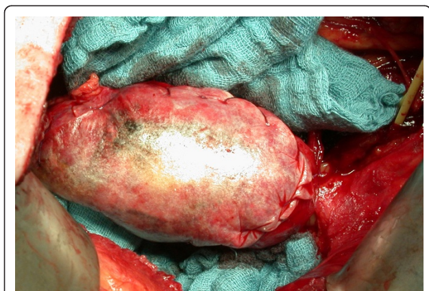
Figure 4 Hydrated porcine small intestinal submucosa (Surgisis ® ) trimmed and tacked in place over the large renal parenchymal defect (cf. Figure 3), fixed with two running sutures.

While it is generally agreed that a nephron-sparing approach should be adopted for surgical treatment of localized RCC, the optimal technique (open, laparoscopic, or robot-assisted) is still under debate and probably of secondary importance [10,24,25].