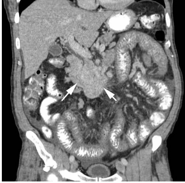
Figure 1 Preoperative abdominal CT scan demonstrating large mesenteric soft tissue mass (white arrows) encasing the mesenteric vasculature with evident bowel wall and mesenteric edema, along with trace ascites fluid.

and chromogranin A levels (76.7 ng/mL, normal < 36.4 ng/mL) were elevated, consistent with a diagnosis of mesenteric carcinoid tumor. His tumor was deemed inoperable after the outside institution's evaluation, and he was referred to a medical oncologist at our hospital. Additional studies then included an EGD with endoscopic ultrasound (EUS) and a fine needle-aspiration biopsy of the mass. These showed a 3.5 cm mass encasing the SMV, and the biopsy confirmed that he had a chromogranin-positive, synaptophysin-positive, keratin AE1/AE3-positive, NSE-negative well-differentiated carcinoid tumor without evidence of atypia (no mitoses or necrosis, ENETS grade G1). Mesenteric angiography revealed severe stenosis or occlusion of multiple SMA branches such as the ileocolic artery, which was reconstituted distally by jejunoileal collaterals (Figure 2).