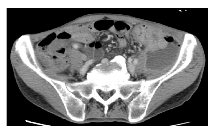
Figure 2 Retroperitoneal abscess adjacent to the sigmoid colon tumor.

ness over the affected area along with changes in skin color, and palpable crepitus[1].