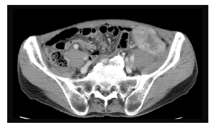
Figure I Sigmoid colon cancer invading to the retroperitoneum at the time of initial diagnosis.

It has been reported that NF has a high morbidity and mortality rate because of its acute and rapidly progressive course. The outcome of NF is rendered poor most importantly by delays in its diagnosis and surgical debridement. Thus, early diagnosis of necrotizing soft-tissue infections followed by administration of intravenous antibiotics and surgical intervention is the best way of decreasing the mortality associated with this aggressive infection. Clinical features of NF include high fever with chills, tender-