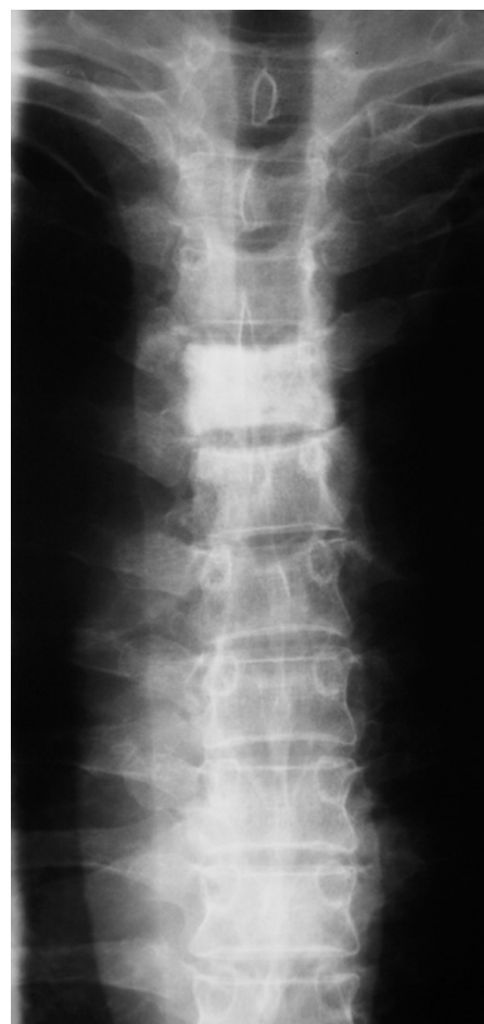
Figure 1 AP X ray of Thoracic spine.

X-rays of the thoracic spine revealed a sclerotic appearance of the T4 vertebral body (Figure 1 & 2) and an urgent Magnetic Resonance Imaging (MRI) showed quite dramatic change in the appearance of T4 compare to the previous CT despite the maintenance of vertebral body height. Furthermore, T5 vertebral body was also involved, but to a lesser extent. There was a soft tissue expansion into the