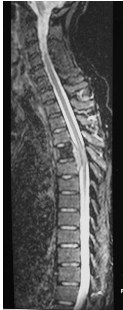
Figure 3 T2W MRI of Thoracic spine.

After discussion with the patient, a decision was made to perform urgent T4 and T5 corpectomies, decompression of the spinal cord and reconstruction of the vertebral bodies. Anterior surgery was contemplated as the compres-