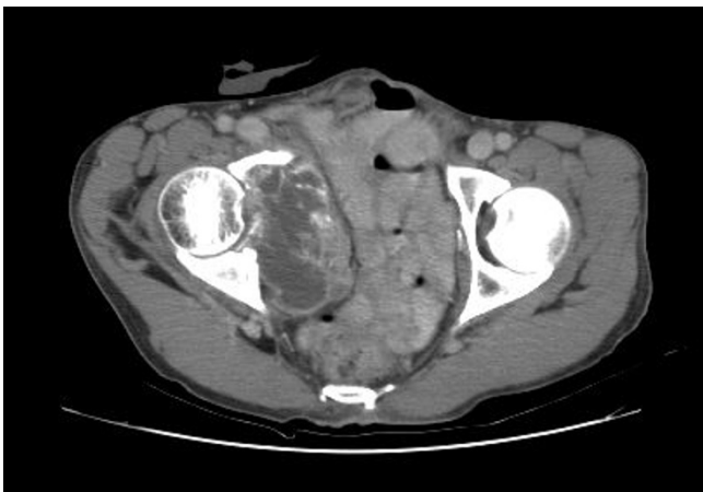
Figure 1 CT scan of pelvis showing a large locally destructive mass lesion. Showing a right sided large heterogeneous pelvic mass with an area of central necrosis with evidence of bone destruction (right acetabular invasion) and distal rectal involvement.

The patient underwent surgical resection of the mass requiring a right hemipelvectomy, end colostomy and a myocutaneous flap closure with penile and scrotal reconstruction. The final pathology revealed an urothelial cell tumor with predominantly low-grade morphologic fea-