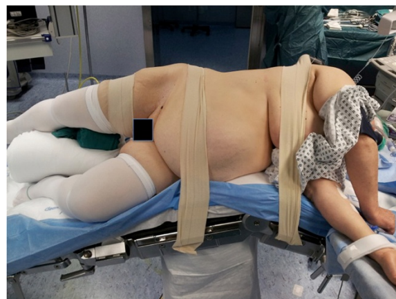
Figure 2 In female patients, a large pillow is placed between the two legs at the level of the foot of the contralateral and the knee of the homolateral leg, to provide an easier access to the urethra.

catheter and the DUBC circumferentially incised up to the perivesical fat to detach it from the bladder using a 365 \mu m Holmium laser fiber or a 5Fr boogie electrode (Figure 3). An 8Fr Nelaton catheter placed alongside the flexible cystoscope provided continuous bladder drainage during the procedure. Finally, a 22Fr Foley urethral catheter was left indwelling. Meanwhile, two other surgeons performed open RNU through a lumbotomic approach as previously described [4].