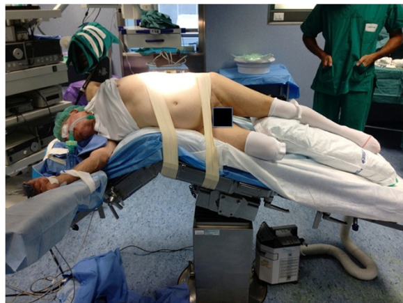
Figure 1 The male patient is placed in the standard lumbotomy position.

Using a flexible cystoscope (f-TUDUBOD), a 5Fr Fogarty occlusion catheter was inserted into the affected ureter; the distal end of the Fogarty catheter was cut to remove it from the instrument and a connector used to inflate the balloon with 1 ml saline for complete ureteral occlusion [4]. The flexible cystoscope was re-introduced alongside the Fogarty