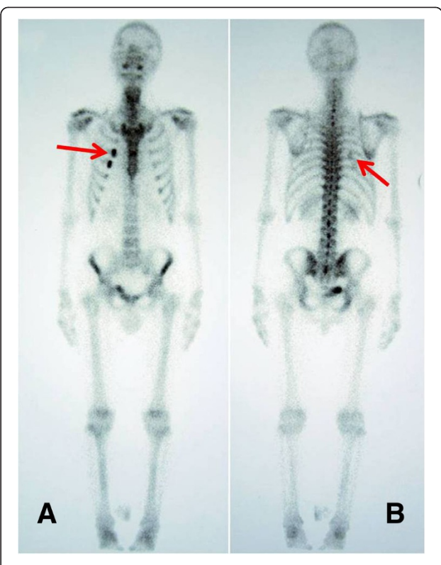
Figure 2 Bone scan of the patient. Abnormally increased uptake of radioisotope in the right third and fourth ribs in a bone scan. A : anterior to posterior view. B : posterior to anterior view. Arrows indicate the tumor.

The ratio of male to female patientsis approximately 1.3:1 and the average age on presentation is 59.5 years