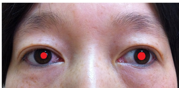
Figure 2 Horner's syndrome (4 months post surgery).

Now, VAT is an alternative to conventional surgery due to its minimal invasiveness. In VAT, however, the small incision on the neck may need to be retracted more forcefully in order to expose the carotid sheath laterally. Theoretically, this may lead to higher incidences of postoperative Horner's syndrome. The incidence of Horner's syndrome was around 0.2% after conventional surgery [3]. However, until recently, the incidence of Horner's syndrome was largely unknown after VAT. From 2011 to 2012, 537 cases of VAT were performed in our department. Two cases of postoperative Horner's syndrome occurred (0.4%). According to the literature, [6,7] there were no statistically significant differences between VAT and conventional thyroidectomy for complications, such as transient recurrent laryngeal nerve palsy and hypoparathyroidism. In our study, the incidence of postoperative Horner's syndrome was relatively higher in VAT. However,