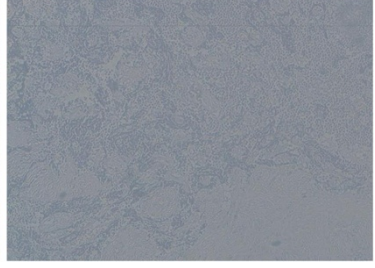
Figure 2 Round or oval tumor cell proliferation containing various differentiated cartilaginous tissues.