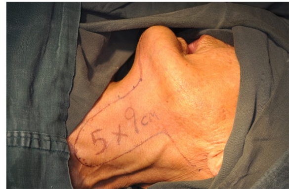
Figure 1 Design of the platysma myocutaneous flap.

The size of the flap was designed according to the anticipated defect resulting from the excision of the primary tumor (Figure 1). Vertical PMF was prepared and raised in the ipsilateral neck of the defect to be repaired, and the incision line was often connected with that of the neck dissection. The flap pedicle was usually located 1.5 cm to 2 cm below the lower border of the mandible. The aspect ratio of the pedicle was mostly 2:1. The flap