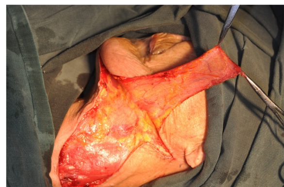
Figure 2 The flap was harvested using sharp dissection with a surgical knife under the adipofascial tissue below the platysmal plane.

The Student's t-test and the \chi^2 test were used to study the statistical difference of the variables. A P value <0.05 was considered significant. The evaluation of postoperative function was performed according to the method described by Hell et al. [6]. A score of 7 points was rated as excellent, 6 and 5 points as good, 4 points as fair, and <4 points was considered poor. For this reason, a patient