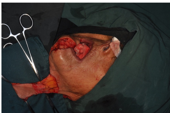
Figure 4 Before reconstructing the defect, the epidermis was removed from part of the flap in the tunnel.

In our series, 54 patients received vertical PMF that sacrificed the facial artery and vein reconstruction after receiving treatment for an intraoral carcinoma. The medical records of these patients were reviewed before surgery. One of the patients had undergone preoperative radiotherapy. Forty patients were men, and the male/female ratio was 2.9/1. The patients were aged between 38 and 80 years (mean, 62.0 ± 10.98 years). The span of operation time ranged from 2.50 h to 9.00 h (mean, 5.7 ± 1.17 h). The stages of cancer reported for these patients ranged from T1N0M0 to T4N2bM0 (Table 1). After tumor excision, the size of the defects ranged from 3.5 × 3 cm to 6.5 × 5 cm. For the vertical flaps, the maximum size was 12 × 5.5 cm and the minimum was 7 × 5 cm. Most of the defects that were reconstructed involved the tongue (32.2%) and the floor of the mouth (37.3%). Final survival of the vertical PMF that sacrificed the facial artery and vein was found in all of the cases, with epidermal loss in 11 cases (20.4%) and