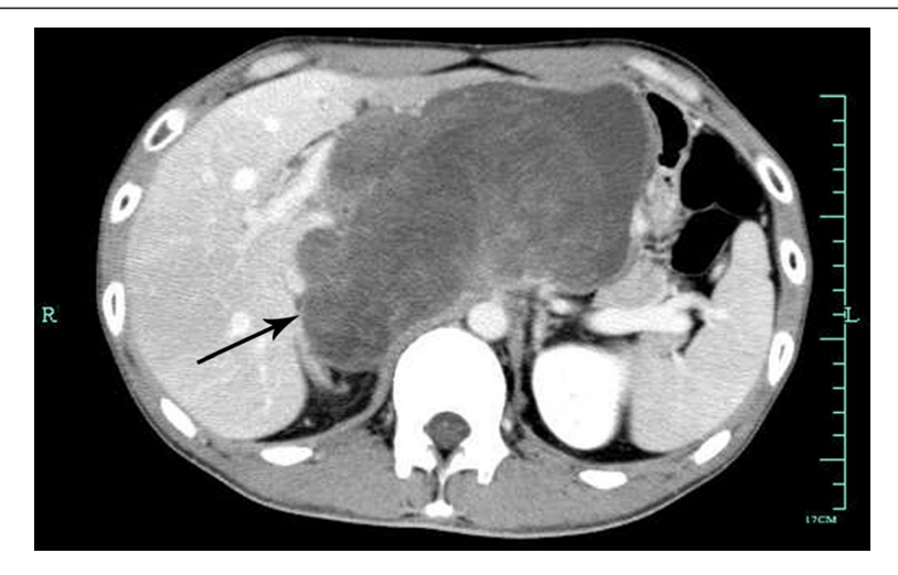
Figure 1 Abdominal computed tomography showing a huge tumor occupying the entire retroperitoneal space.

All imaging studies and serology examinations indicated that surgery was feasible. At surgery, a huge, soft, whitish, solid and cystic tumor was found, which occupied the entire abdomen. The tumor appeared to involve the distal stomach, the diaphragm, the hepatoduodenal ligament, the gastrohepatic ligament, the left lobe of the liver and the celiac trunk. It was also compressing the walls of the abdominal aorta and the inferior vena cava. Massive varicose veins were noted in the abdominal cavity. Part of the left lobe of the liver was resected due to tumor infiltration. A distal gastrectomy with a Billroth II anastomosis was simultaneously performed due to tumor involvement of the stomach. In addition, we suspected that the common bile duct had also been invaded by tumor, which was not evident on preoperative imaging, and we therefore performed a resection of the common bile duct, a cholecystectomy and T-tube drainage. Intraoperative histological examination of a frozen section suggested the presence of a soft tissue sarcoma.