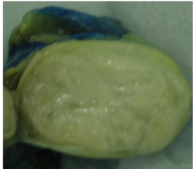
Figure 2 Macroscopic appearance of the tumour showing lobules of fatty tissue with bands and nodules of firm white tissue.

Myolipoma is a rare benign neoplasm, occurring most frequently in adults in the deep soft tissue of the abdomen or retroperitoneum. It is a benign tumour composed of variable amounts of benign smooth muscle fibres and mature adipose tissue with no lipoblasts, floret-like giant cells or zones of atypia.