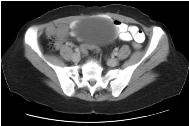
Figure 1 Computed tomography scan showing a mass in the right iliac fossa region.

resonance imaging confirmed the presence of the mass in the right iliac fossa. It was separate from the caecum and lying inferior to it. The differential diagnosis was an inflammatory mass or a pedunculated lesion from the small bowel such as a pedunculated tumour or even a Meckel's diverticulum. Both ovaries were normal. Operative findings were that of a retroperitoneal mass. Excision of the mass was done with repair of the hernia.