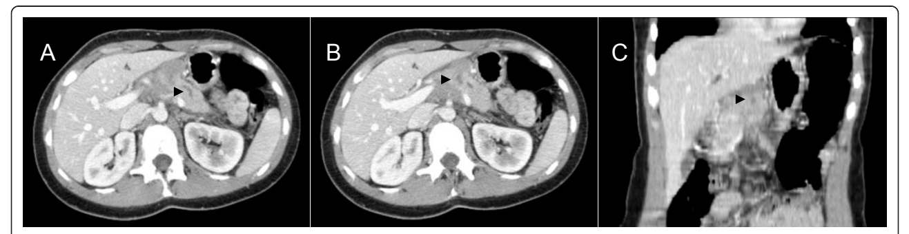
Figure 2 Abdominal computed tomodensitometry, with injection of contrast product, portal sequence. Axial (A) projection showing Wirsung dilatation (arrow head). Axial (B) and frontal (C) projections showing low density pancreatic mass (arrow heads), case n°2.

GS can occur in patients of all ages with a focus on male patients (male:female ratio 1.2:1) during the last decades of life (median age is 56 years, range: 1 month - 89 years) [7,16]. Even if the overall prognosis of AML is favorable, the association with GS makes worsens the prognosis because only 24% of patients with GS will be alive 2 years after the initial diagnosis, with an overall median survival of 7 to 20 months [3,17].